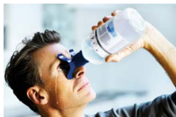
Lean your head backwards and rinse