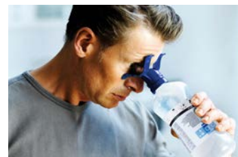
Or lean your head forward to avoid wet clothes