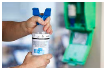
Twist the lid until the sealing breaks