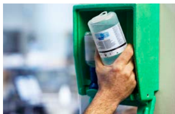
Remove the bottle from the station