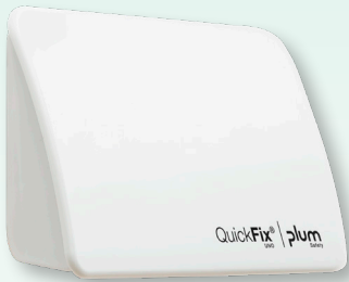
Plum QuickFix Uno, white

A Plum QuickFix plaster dispenser provides a structured approach to first aid of minor injuries. It is a flexible system for workplaces that are not challenged with dust and dirt. Both the Plum QuickFix Uno and Plum QuickFix SOLO® are small dispensers that combine workplace safety with modern style.