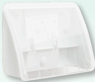
Plum QuickFix Uno, transparent