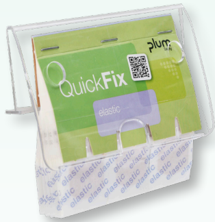
Plum QuickFix SOLO®, transparent - shown with example of plaster refill